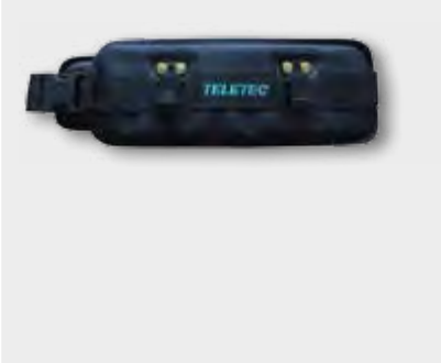
Abdominal belt for radio transmitter TMS-16

Battery charger FC-AK5 for 230 VAC or 24 VDC for charging the change-over battery AK5