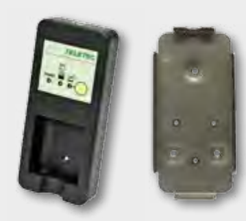
Charger Optionally with wall holder

Battery charger FC-AK5 for 230 VAC or 24 VDC for charging the change-over battery AK5