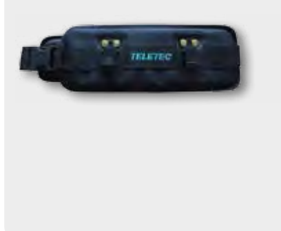
Abdominal belt for radio transmitter TMS-56

Battery charger FC-AK5 for 230 VAC or 24 VDC for charging the change-over battery AK5