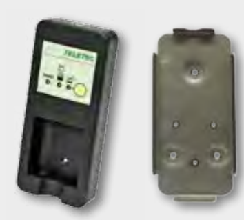
Charger Optionally with wall holder

Battery charger FC-AK5 for 230 VAC or 24 VDC for charging the change-over battery AK5